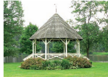
Cranbury Bicentennial Gazebo in Village Park

Cranbury is one of the oldest towns in New Jersey. It is believed that there were settlers here as early as 1680, when the town was known as Cranberry and Cranberry Town. A deed dated 1698 for land "with all improvements" indicates buildings on the land and earlier settlement. Cranbury celebrated its 300th anniversary in 1997.